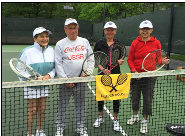
The Intermediate Group Winners