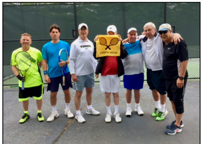
The Advanced Group